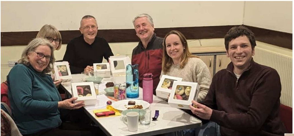
The winning team